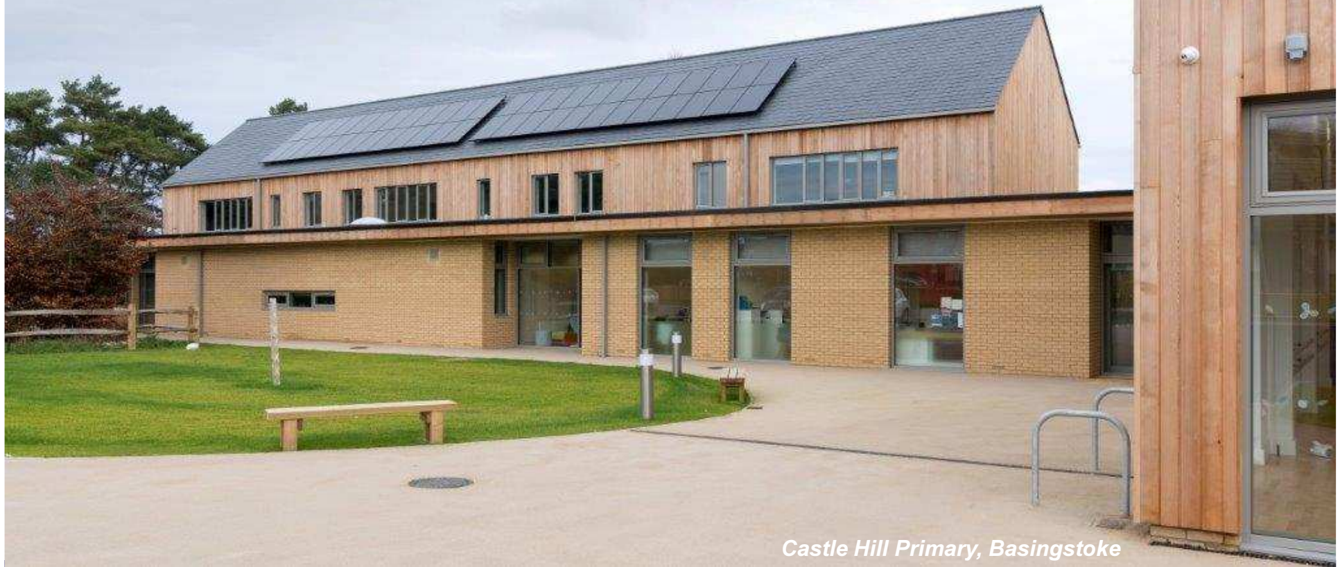
Castle Hill Primary, Basingstoke

That the Children and Young People Select Committee support the recommendations being proposed to the Executive Lead Member for Children's Services in section 1 of the report.