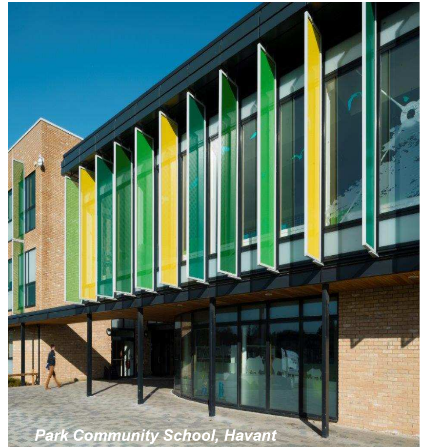
Park Community School, Havant