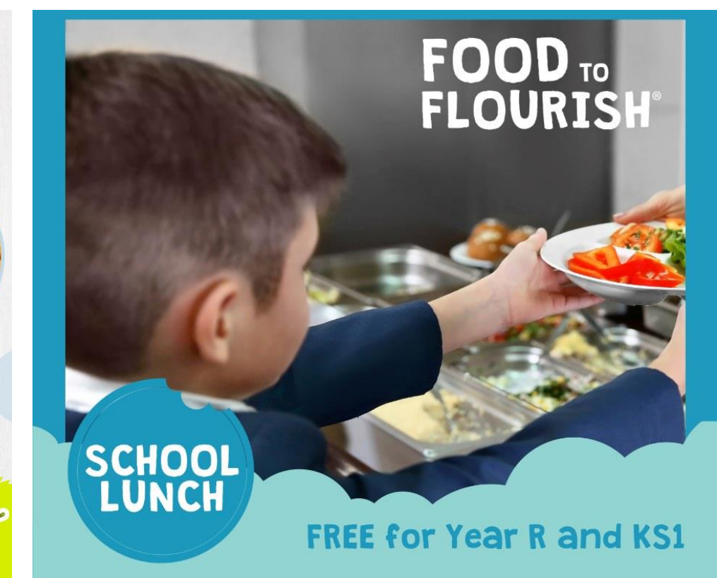
Examples of social media posts