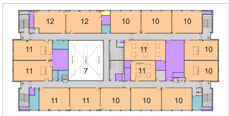
Proposed Second Floor Plan