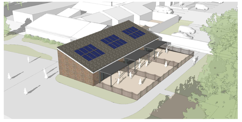
Proposed Classroom Extension