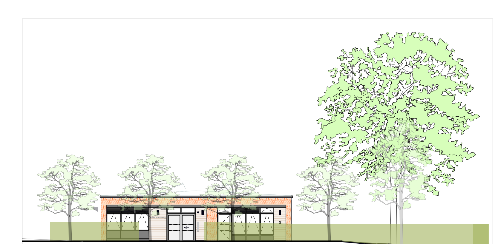
Proposed SEN Building West Elevation