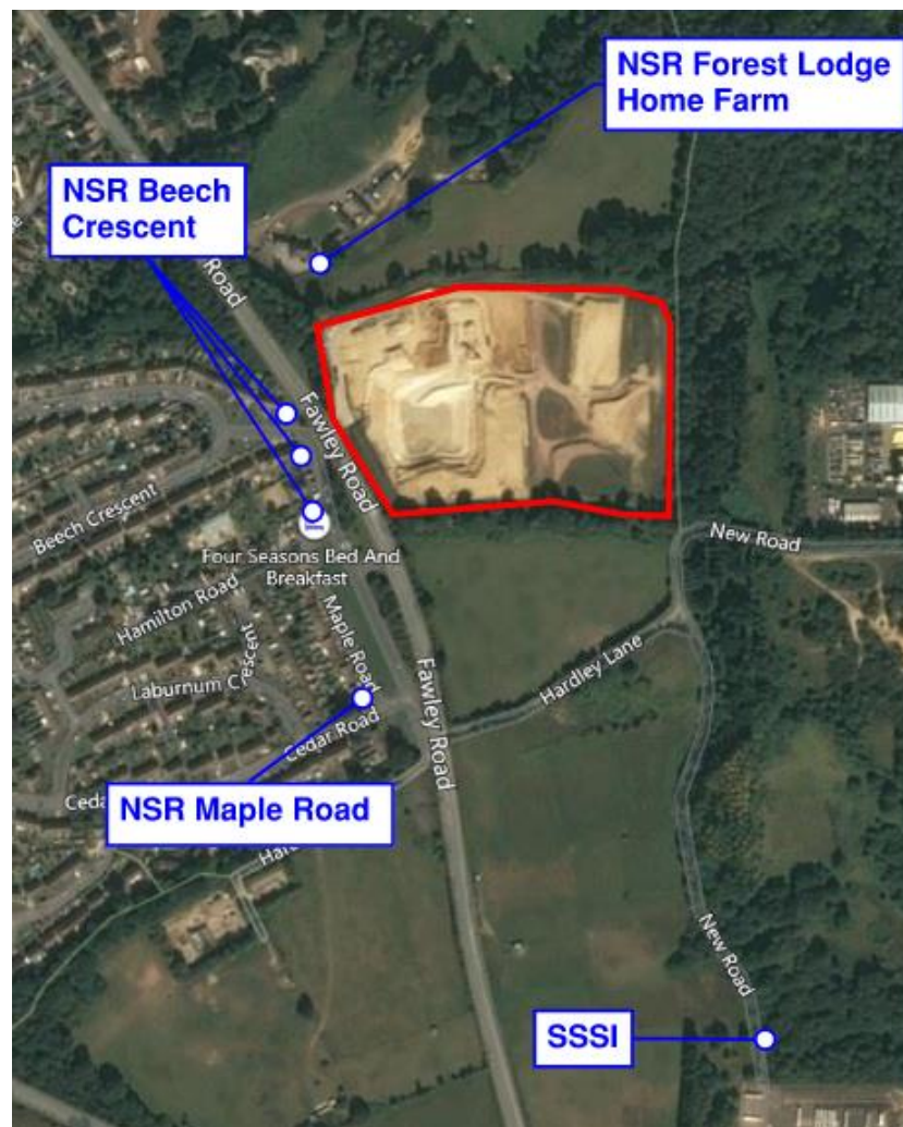
Figure 2-1 Site location and NSRs

The approximate site boundary is shown in red and the NSRs are given in blue in Figure 2-1.