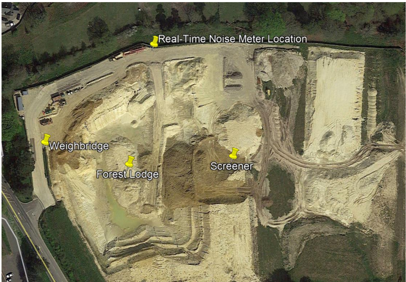
Figure 3-1 Monitoring Location

The approximate location of the screener, which is considered to be the main noise source at the Site, and the location of the weighbridge is also shown on the image.